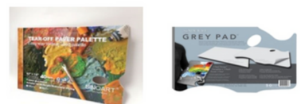
OIL PAINTING PALETTES