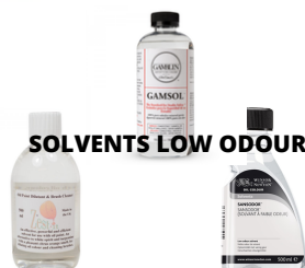
SOLVENTS LOW ODOUR